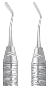
CIGFT36 Plastic Filling Instrument Goldstein #3, hdl #6 Flexi-Thin