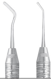
CIGFT16 Plastic Filling Instrument Goldstein #1, hdl #6 Flexi-Thin