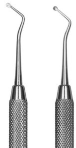
EXC19H Excavator #19 hdl #41 heavy

CONTACT YOUR DEALER TO FIND OUT ALL THE CODES ON OFFER