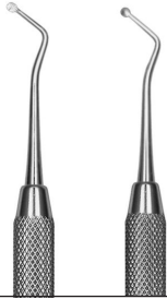
EXC18H Excavator #18H hdl #41 heavy