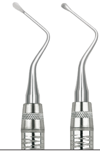
CL856 Surgical Curette Lucas #85, hdl #6 2,8 mm