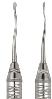
TKN1 Tunneling Knife #1 hdl #6