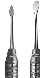
PPBUSER6 Periosteal Buser hdl #6